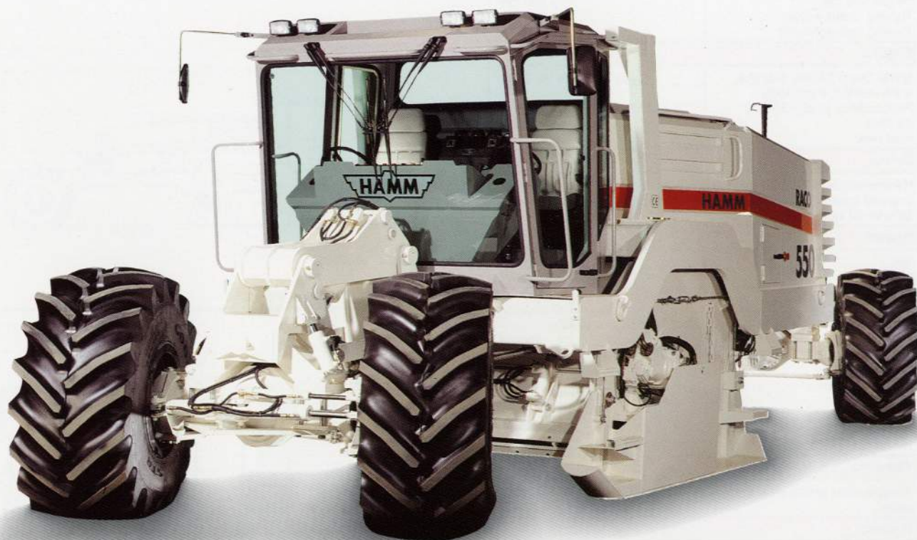
Machine including optional equipment

High engine performance with optimum air filter cleaner